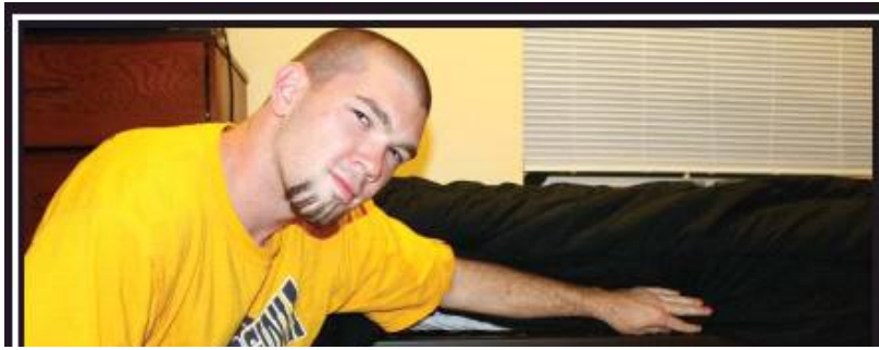
Hall makes the most of his space by storing video games in the extra storage area under his bed. The bed frames also have drawers underneath for even more storage.